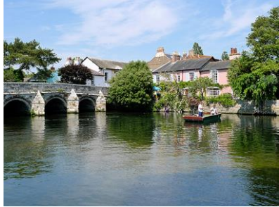
The River Avon – Christchurch

There is a solar heated outdoor swimming pool for use by the site residents only. Casual visitors are not permitted to use it.